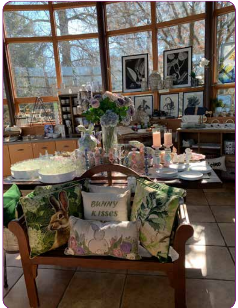
Spring in the Shop