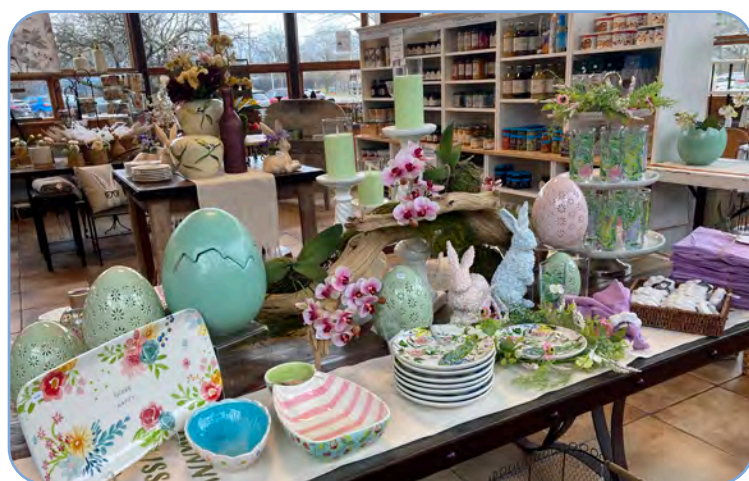
Spring in the Shop