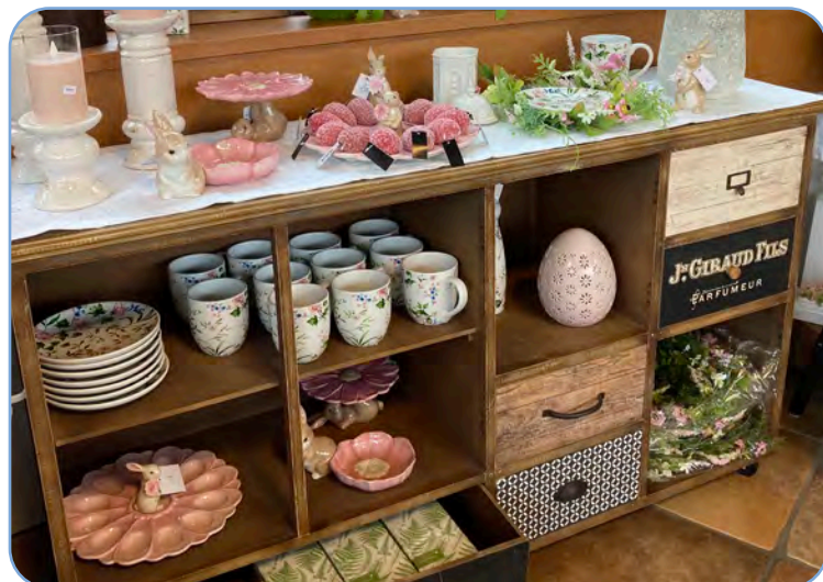
Spring in the Shop