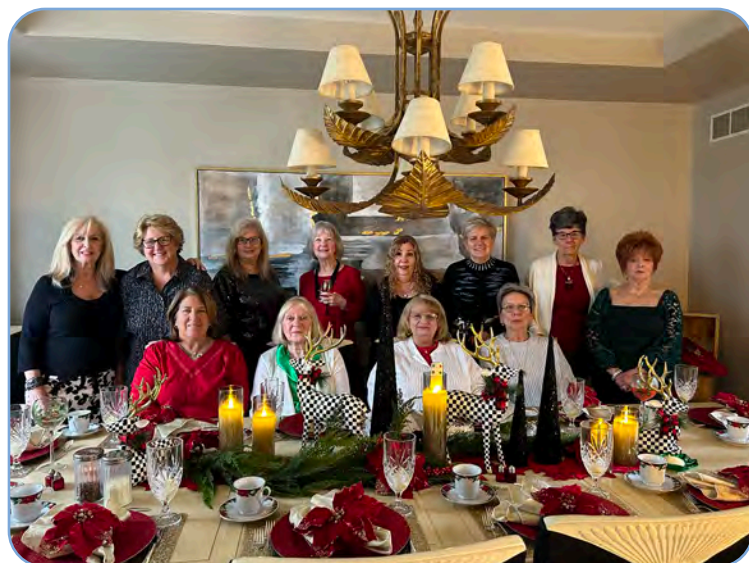
Shop Staff and volunteers

We are also very grateful for our staff and volunteers for their many hours of dedication and support. We took time out on a wintry Monday to enjoy a lunch and fellowship hosted at the home of our Shop Manager.