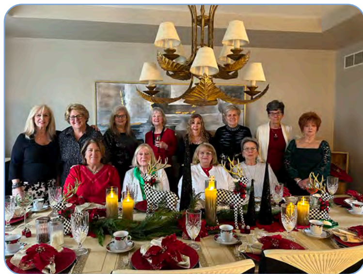
Shop Staff and volunteers

We are also very grateful for our staff and volunteers for their many hours of dedication and support. We took time out on a wintry Monday to enjoy a lunch and fellowship hosted at the home of our Shop Manager.